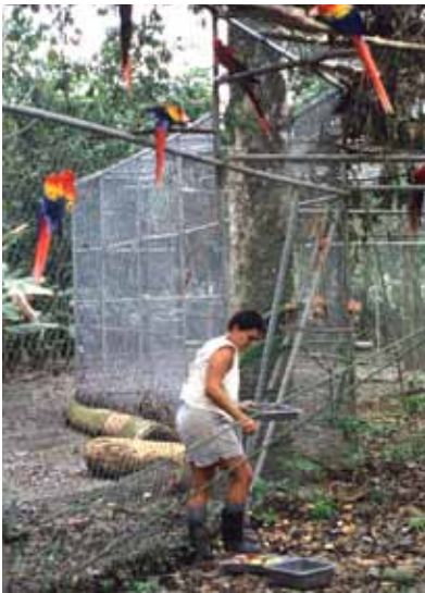
Zoo Ave release site in San Josecito

Next to purchasing land with the goal of saving the Esquinas rainforest, Rainforest of the Austrians is also trying to protect the land from illegal loggers and hunters, reintroduce endangered species, and conserve the area's endangered wildcat population. Conservation efforts are being implemented in close cooperation with the National Park Service and local NGOs. Since 1998, the organization has donated $275,000 towards species protection in the Esquinas Rainforest.