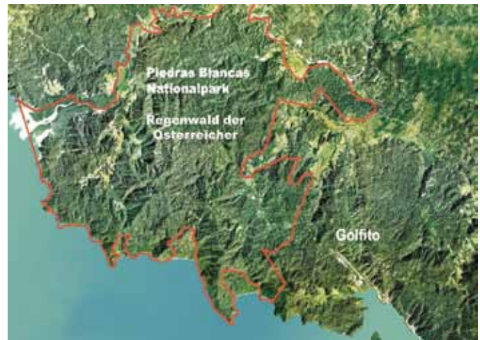
Piedras Blancas National Park 2011

dark green area (26%) = purchased by Rainforest of the Austrians light green area (46%) = purchased by other organizations red area (28%) = not yet purchased