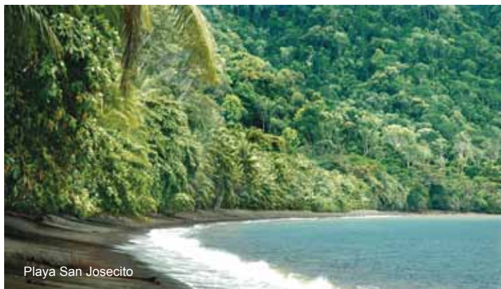
Playa San Josecito

dark green area (26%) = purchased by Rainforest of the Austrians light green area (46%) = purchased by other organizations red area (28%) = not yet purchased