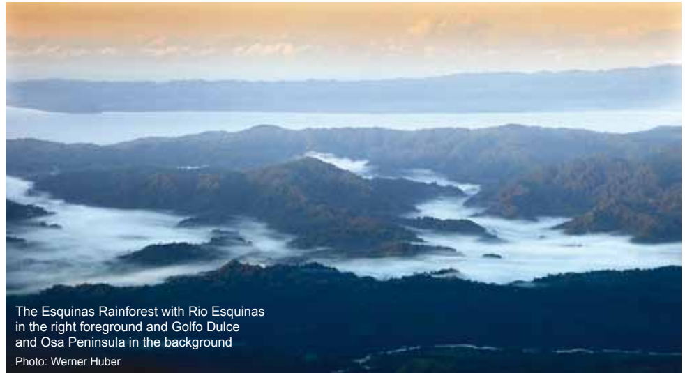
The Esquinas Rainforest with Rio Esquinas in the right foreground and Golfo Dulce and Osa Peninsula in the background